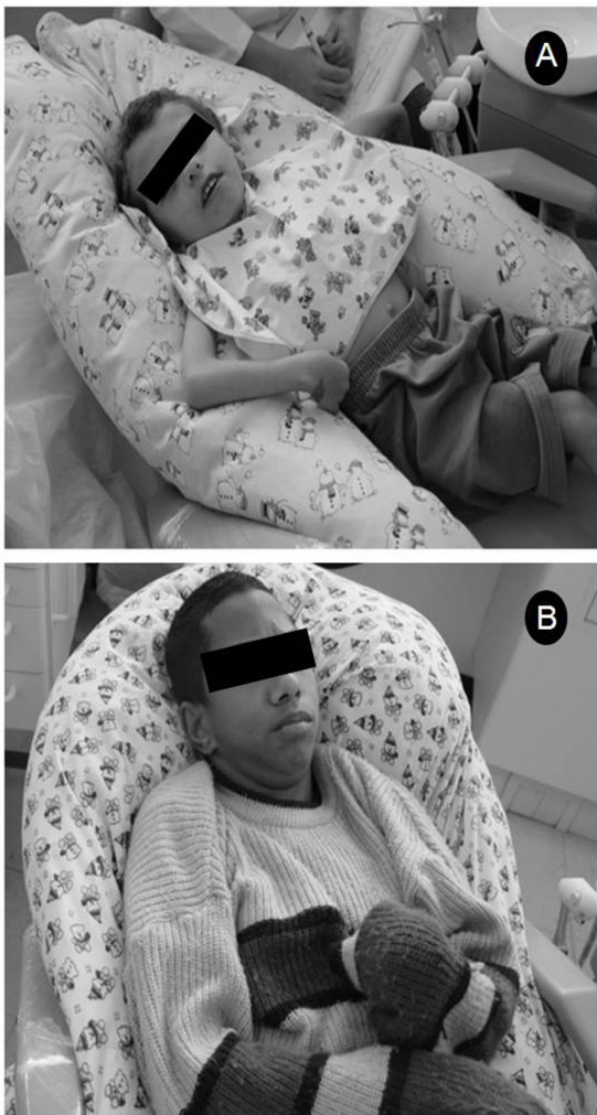
Figure 2. Examples of devices made of foam rolls and cloths to provide support for the trunk, arms and legs of special needs patients with physical limitations. A: "Grandma's pants"; B: "The Worm".

cloth, which have been developed by occupational therapists to provide support for the trunk, arms and legs of special needs patients with physical limitations. These devices provide comfort to the patient during treatment and a good working position to the dentist, which directly contribute to shorter and less fatiguing clinical sessions with consequently better treatment outcomes 12 . However, the "Grandma's pants" and "The Worm" are not intended to provide patient immobilization and so other resources should be used in association whenever physical restraint is required.