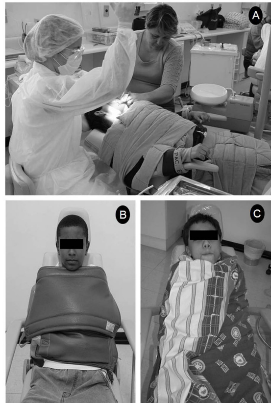
Figure 1. Examples of auxiliary devices used to accommodate the patient's body in the dental chair during clinical sessions A: Restraint band to immobilize a patient on the dental chair; B: Godoy's device: stabilization of patient on the chair; C: Physical restraint by the use of blankets.

Physical restraint of children up to 10 years of age can be done with blankets (Figure 1C). After this age, the use of blankets is usually no longer effective because of the child's size and strength. For an adequate immobilization, the patient must be put with the arms crossed over the chest, in such a way that the legs can also be immobilized.