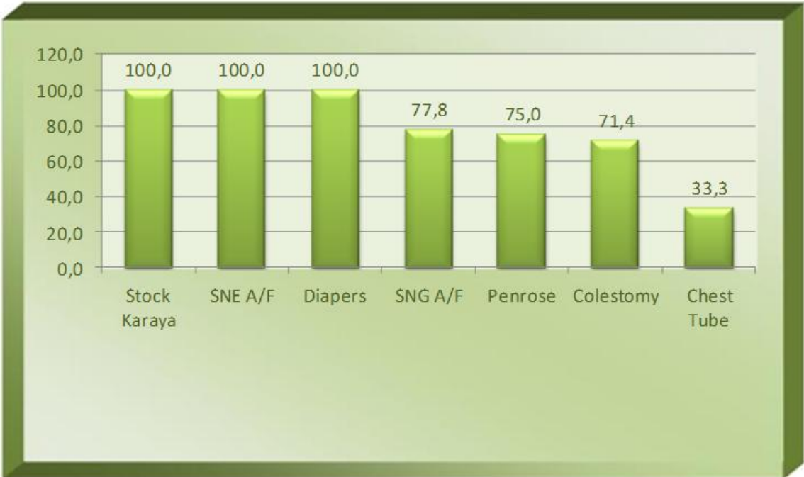
Figure 3. Percentages of incorrect descriptions in relation to the volumes of the respective drainage devices in patients who were admitted to the ICU from January to March 2012.

The non-conformities (not description of drainage volumes in one or more work shifts) in the description of the volumes of the drainage devices are represented in Figure 3.