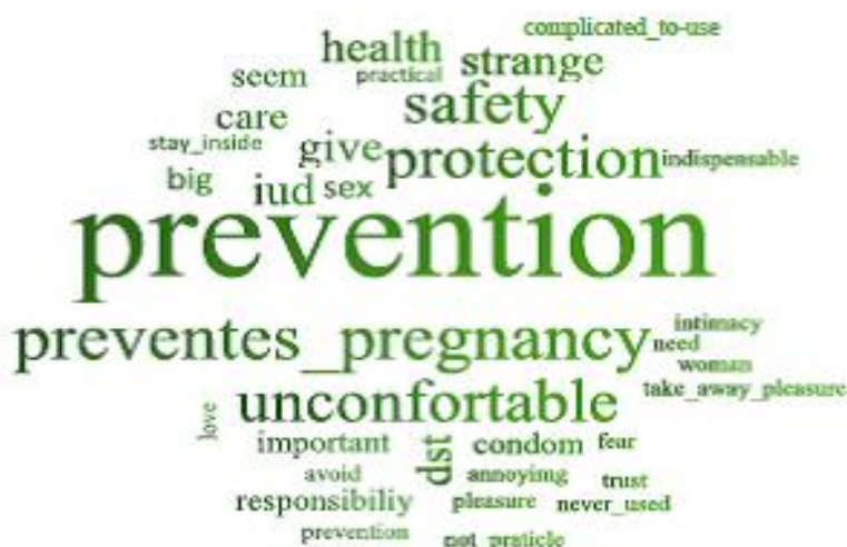
Figure 2. Cloud of words to the term inducer "female condom". Senhor do Bonfim (BA), Brazil, 2018.

of the representations evidenced in the tree of similarities.