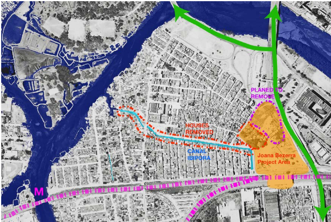
Figure 3 Houses removed from the Projects of Joana Bezerra and Canal Ibipora in Coque

Inaugurated in 1994, the metro and bus station of Joana Bezerra, next to the community of Coque brought the possibility to the community to be connected to this public transportation facility, on the other hand, both projects may have removed many families within the area. In the past, before the metro stations existed, there was a train station instead. That area of the neighborhood was called Beira da Linha (Train Line Border).