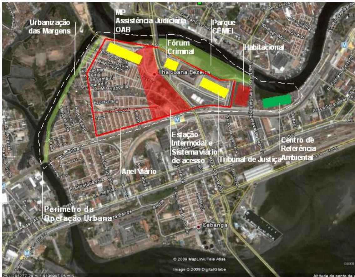
Figure 2 Image of the Modifications planned for the Judiciary Pole in Coque's Territory