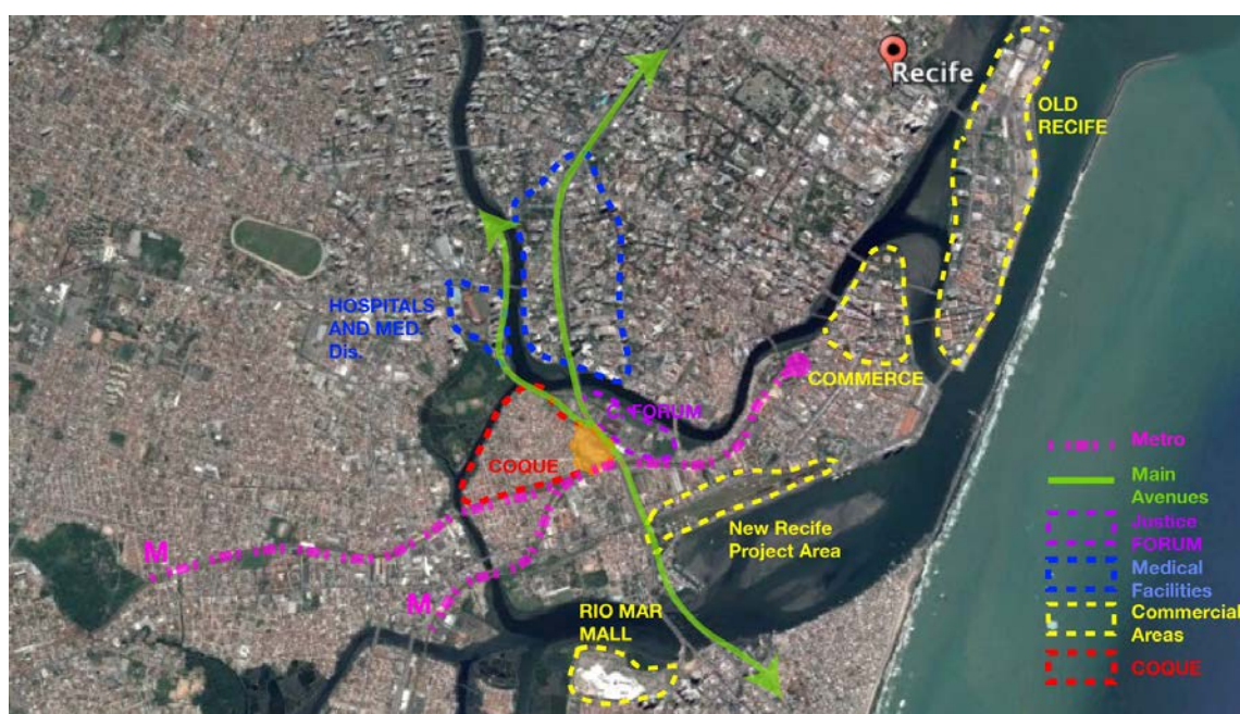
Figure 1. Urban Dynamics around the Community of Coque

Because of its location, nearby the city's center and surrounded by an elite urban development, the community has been the subject of territory disputes among government authorities that insist in developing urban exclusive projects, and residents of the community who fight to stay.