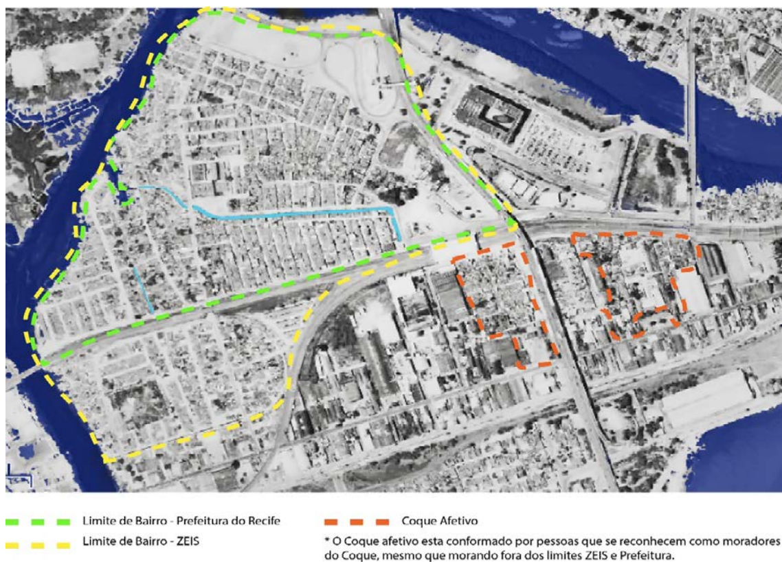
Figure 6. Boundaries of the Community of Coque.